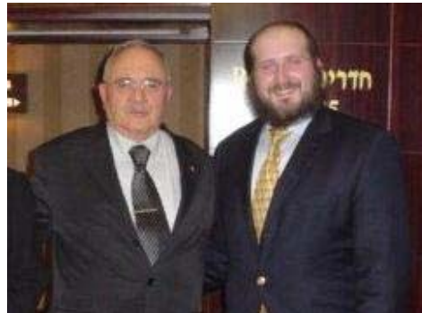
Turkey - Defence Minister Vecdi Gunul